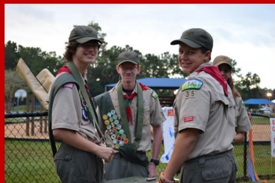
If you have pictures of the troop please send to admin@troop35jax.org